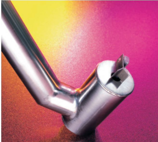
One of the industry's most unique viscometers for in tank blending and reaction monitoring.

FOR VISCOSITY MEASUREMENTS FROM 0.2 TO 20,000 CENTIPOISE